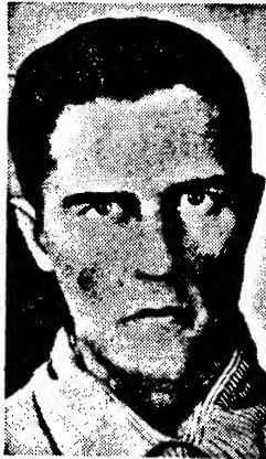
ALVIN KARPIS Fugitive kidnapper and gangster, who is believed by police and Federal agents to have engineered yesterday's $48,000 robbery of the Delaware County National Bank, in Chester, from a Detroit hideout